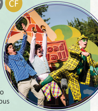
Image: Immersion Theatre's The Wind in the Willows