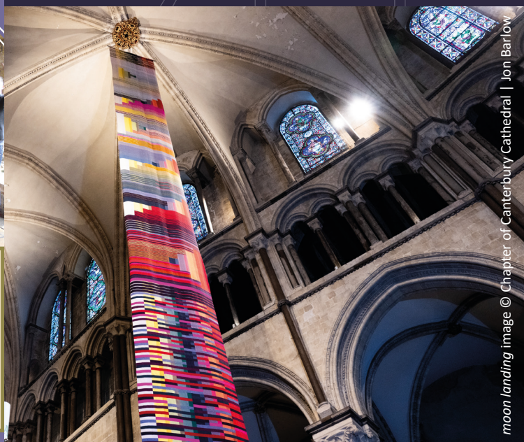
moon landing image