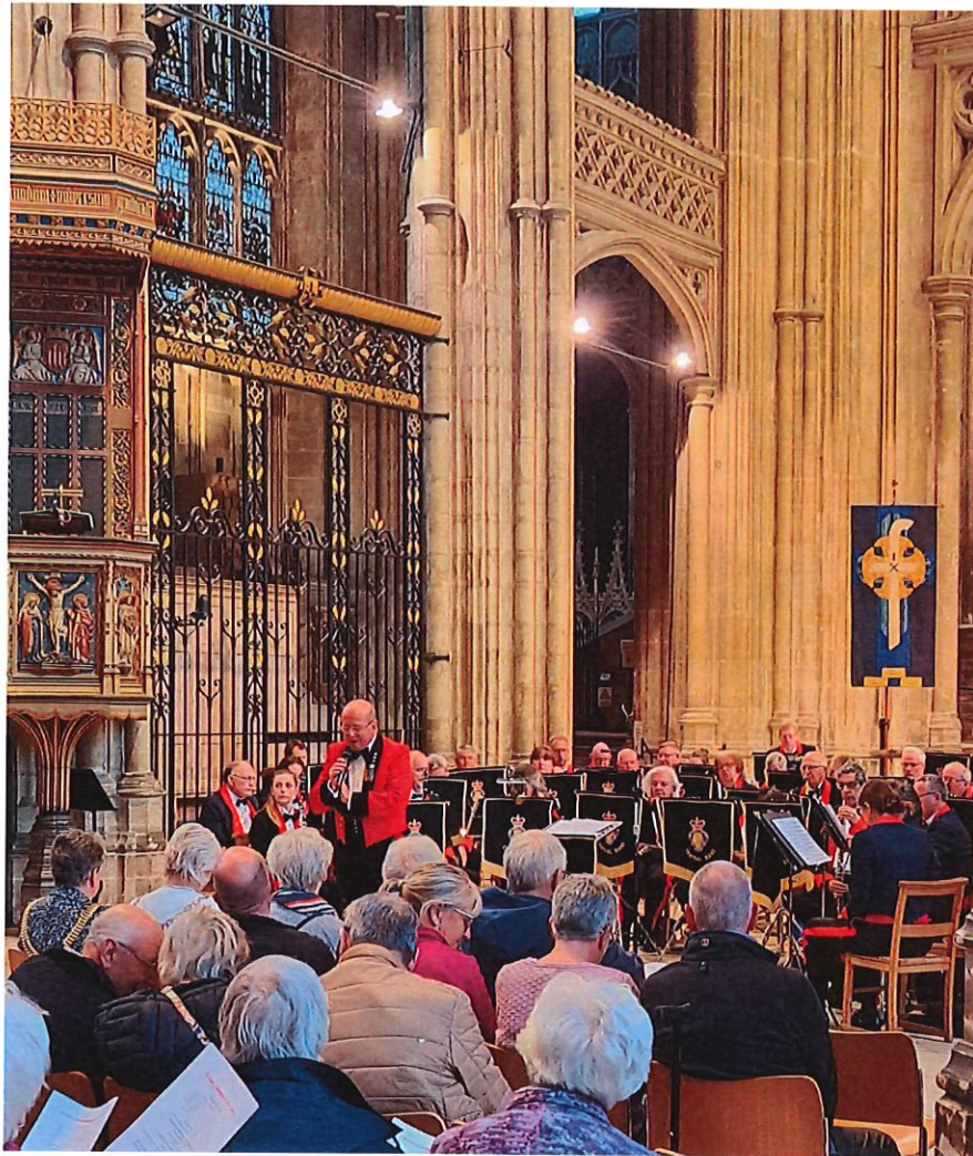
The Friends hosted a Royal British Legion concert for the 80 th anniversary of D-Day