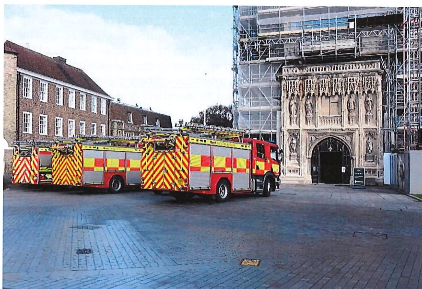
The Friends' Grant for fire safety equipment helps to keep our Cathedral safe

All of the Charity's activities are guided by these objects which have remained the same as our previous Trust Deed following our change to a CIO.