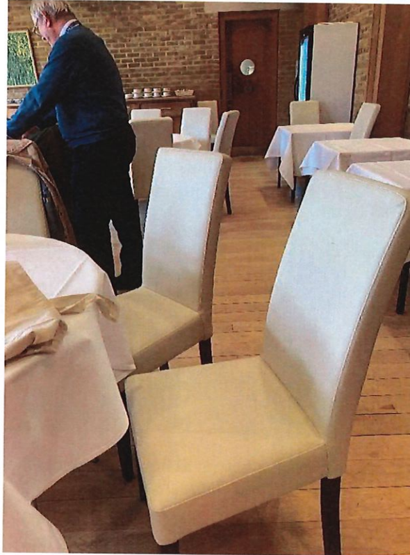
New chairs in the Cathedral Lodge Refectory were funded by a Grant from The Friends