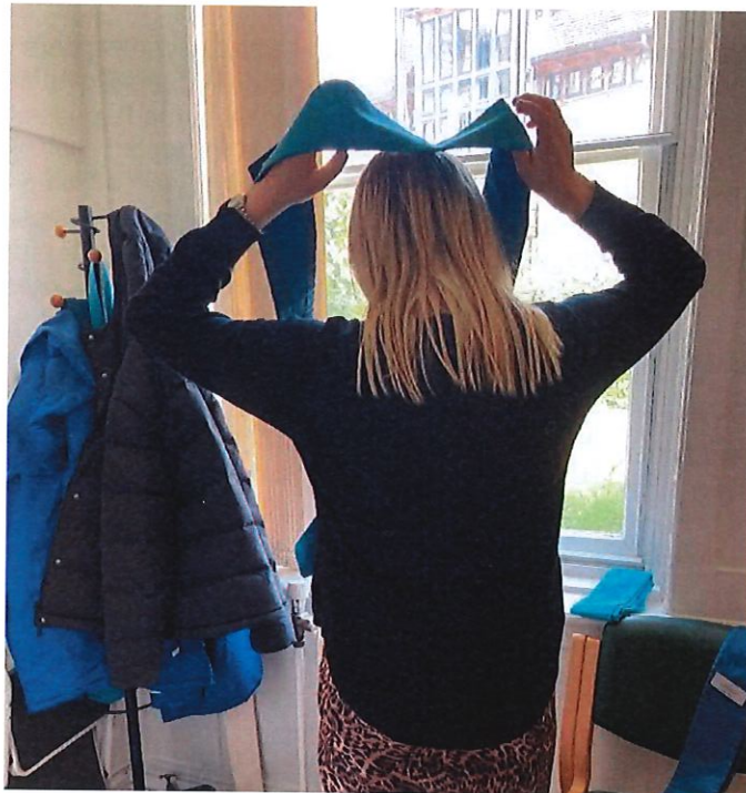
Friendly volunteers, who wear blue sashes, help promote our Charity at the Friends' Desk