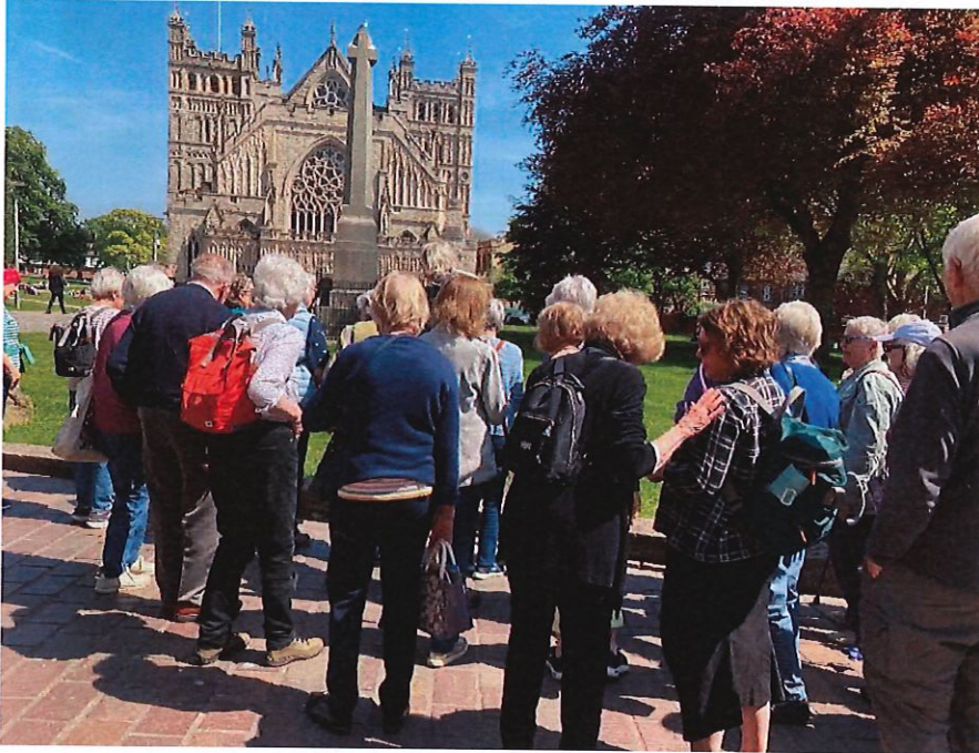
The Friends visited Exeter Cathedral during the annual holiday in 2024