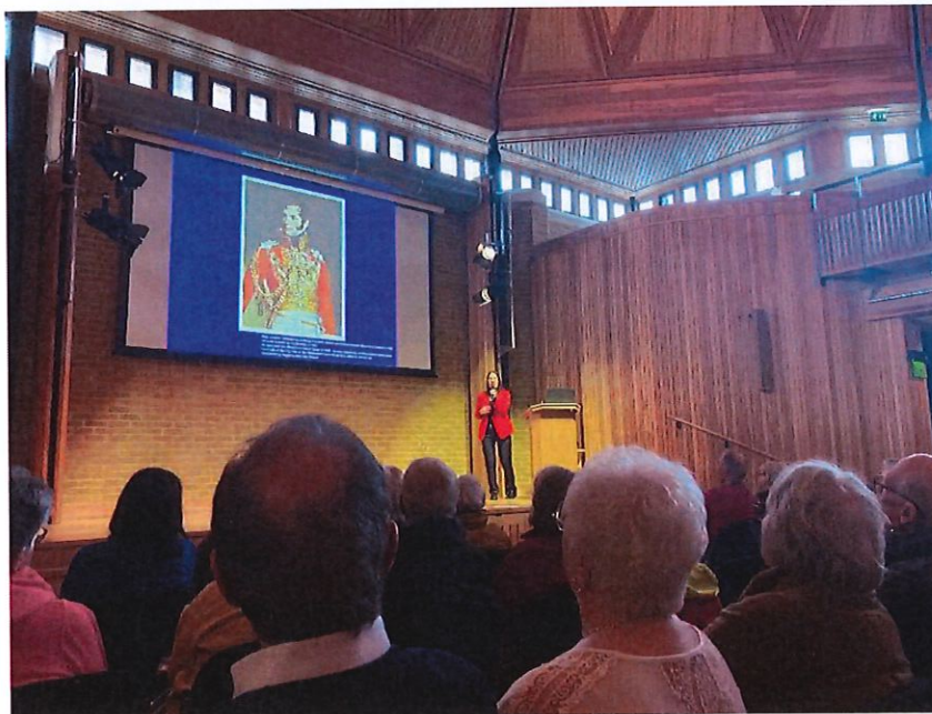
Friends enjoy talks in the Clagett Auditorium throughout the year

Staff: In the event of a sudden loss of Key Staff, the Trustees are in a position to maintain the Charity's objectives thanks to a Shared Level Service Agreement with other Cathedral departments; these include the assistance of Information Technology, Human Resources, and Events departments with whom the Charity already works closely for the benefit of running the Charity and maintaining the Friends' community.