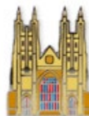
West Front Pin Badge A colourful and detailed pin badge of the west front.

All profits go towards the upkeep of Canterbury Cathedral